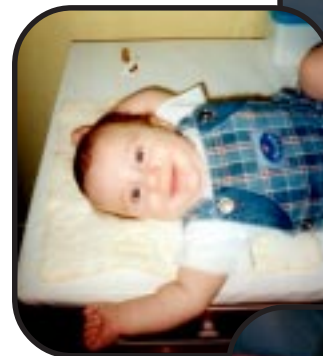
left: "Guess what I just did!"