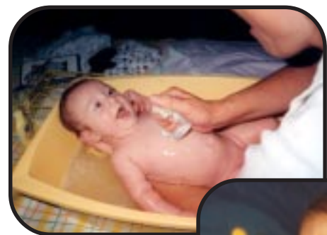
above: not quite a jacuzzi, but awfully nice!